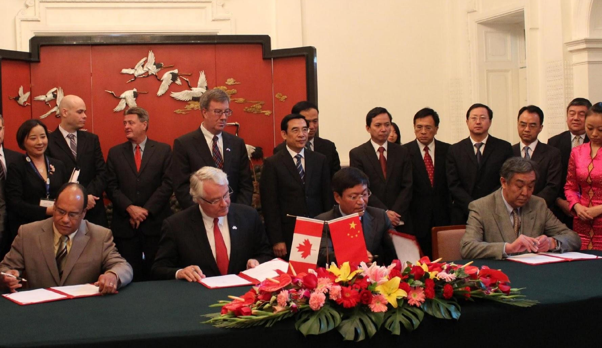
Signing the “ZDG – Invest Ottawa Incubation Services Agreement” 签署“中关村发展集团 – 渥太华投资署孵化服务协议”