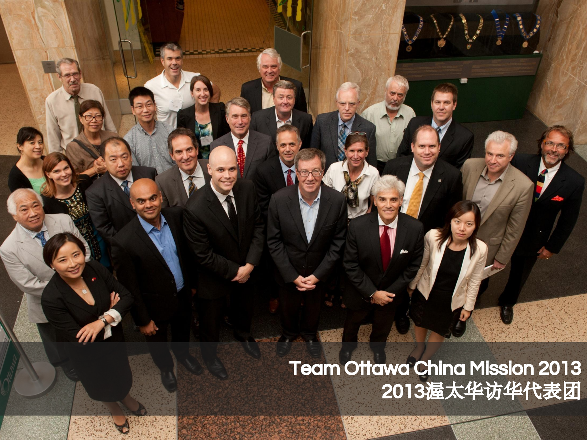
Team Ottawa China Mission 2013 2013渥太华访华代表团