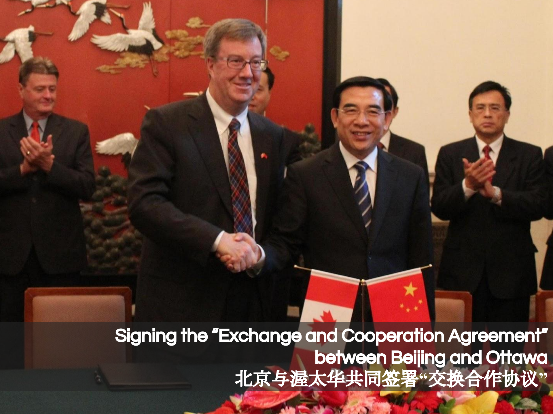
Signing the “Exchange and Cooperation Agreement” between Beijing and Ottawa 北京与渥太华共同签署“交换合作协议”