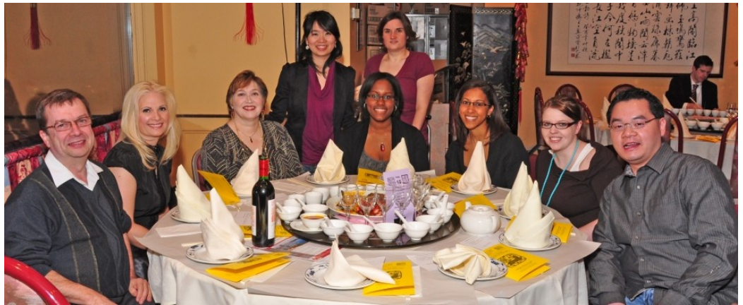
Young and old had a great time