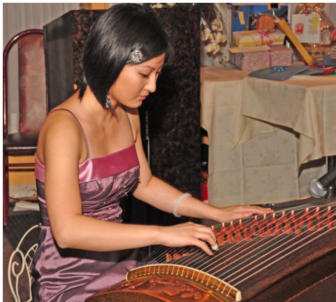
Zither music from heaven...