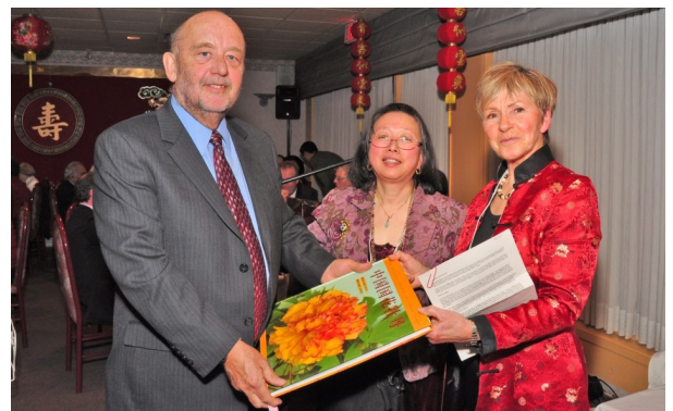
Lots of door prizes...