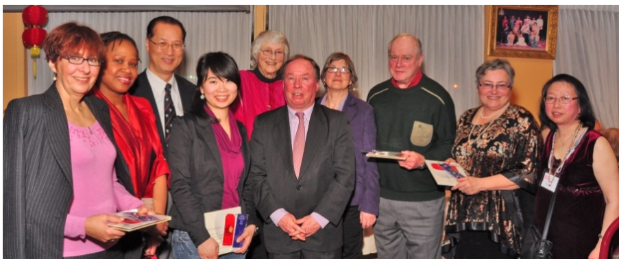
Tigers All: born in the year of the Tiger