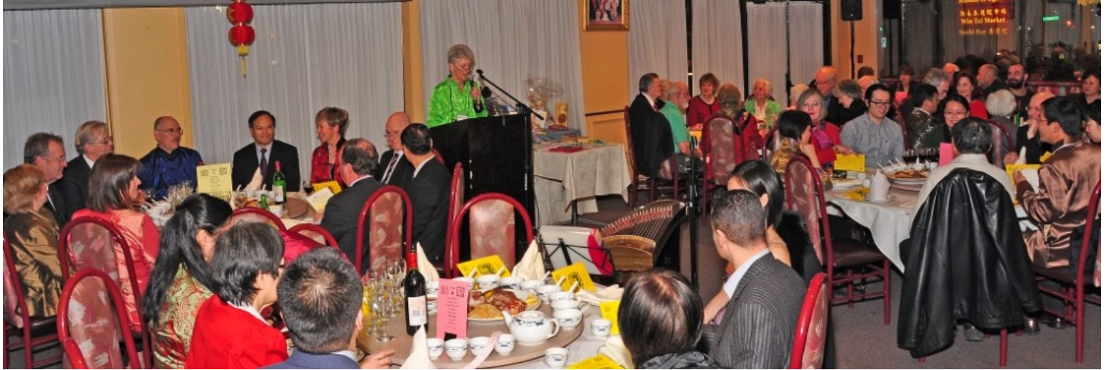
Calling the meeting to order...

The evening was rounded out by a quiz on Canada-China relations and lots of door prizes. ♦