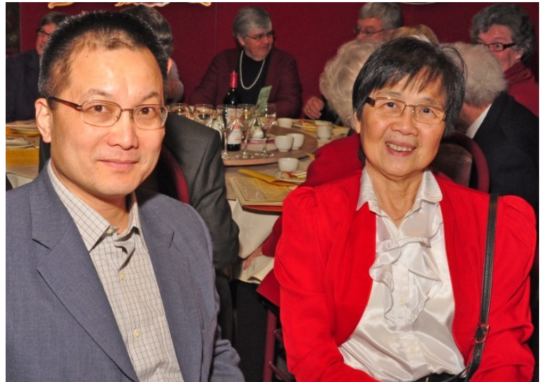
Lots of new friends...