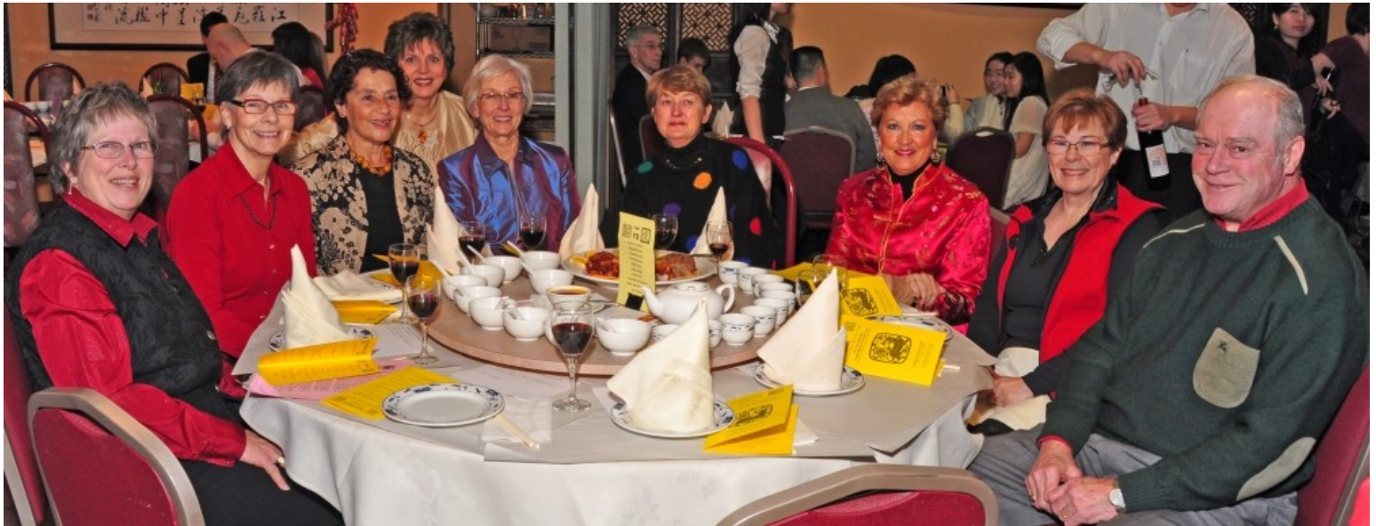
Eagerly awaiting the banquet...

Among the many dignitaries were Chinese Ambassador Lan Lijun and