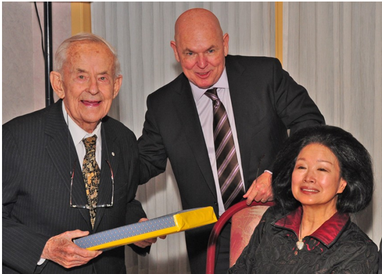
Young and old friends of China...