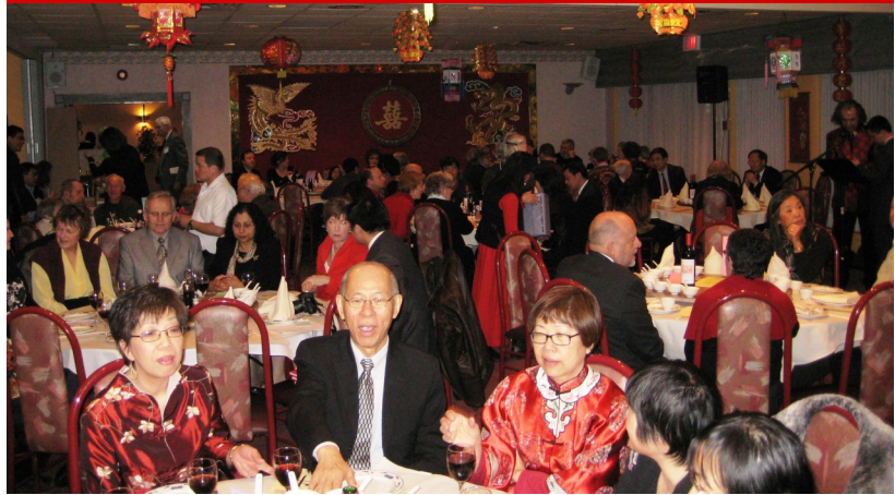
Over 145 people gathered for a sumptuous banquet at the Ogilvie Mandarin Restaurant

Over 145 people took part in the lively CCFS annual New Year's banquet on February 8 th at the Mandarin Ogilvie Restaurant. The evening was enlivened by music, door prizes and a quiz testing our knowledge of China and Canada-China relations.